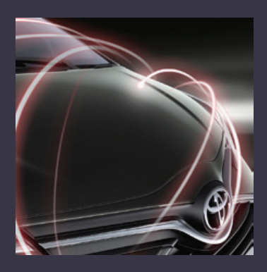
BODYWORK PROTECTION €360.00