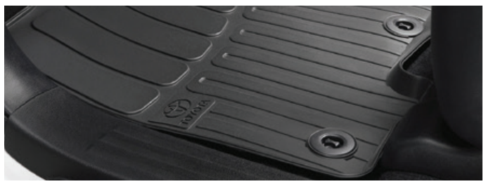
RUBBER FLOOR MATS

Genuine tailored fit rubber floor mats help protect your carpets against the very worst conditions. They are impervious to dirt, mud and water and can removed for easy cleaning.