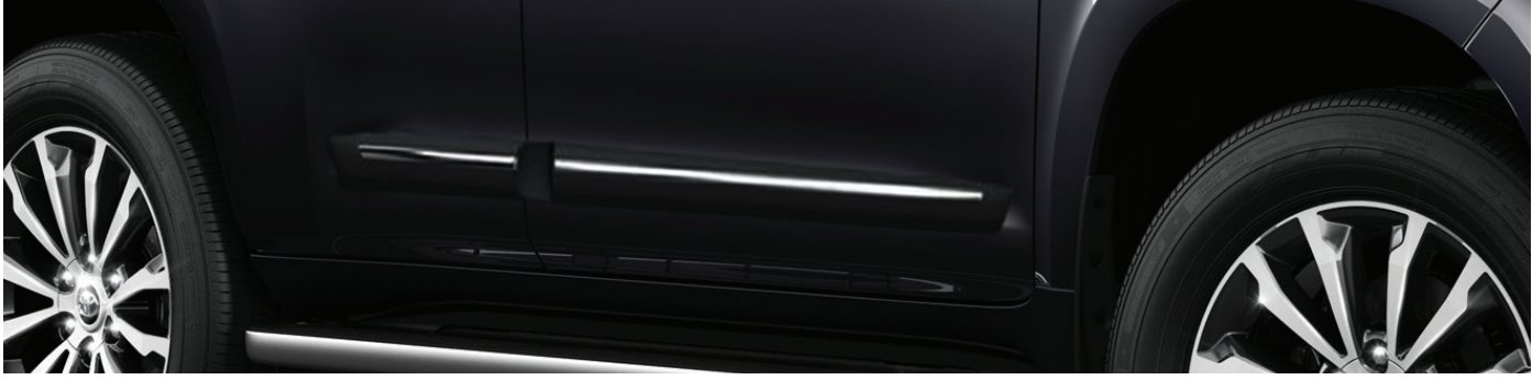
Side mouldings provide your vehicle with an extra layer of protection to help guard the side panels against minor bumps and scrapes.