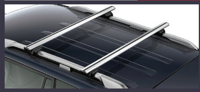
Toyota cross bars are designed in combination with Toyota roof rails. They are aerodynamic, made of aluminium, fully lockable and very easy to fit.