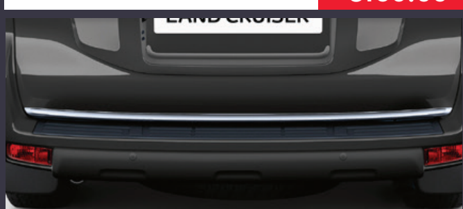
A detail providing that subtle extra touch of pure quality.