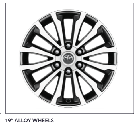
(COMES WITHOUT TYRES 265/55/R19)

Style and individuality combine in a distinctive alloy wheel design that has been quality engineered to optimise balance and durability.