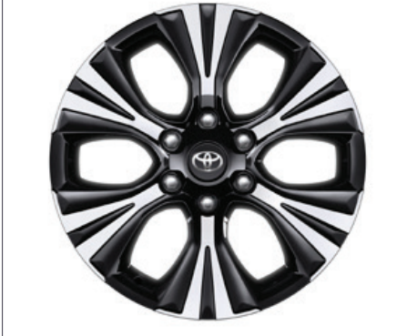
19" ALLOY WHEELS (COMES WITHOUT TYRES 265/55/R19)

A stylish design offering lots of personality. Like all Toyota alloys, it is precision engineered for optimum drive balance.