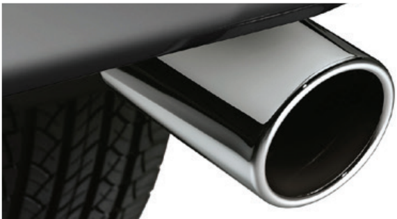
A chromed stainless steel tailpipe adds even more to the finish by presenting an eye-catching accent of quality and co-ordination.