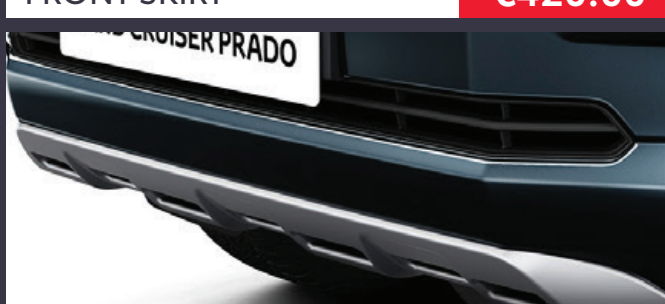
The look of the city combined with off-road appeal. Ideally compliments the rear underguard.