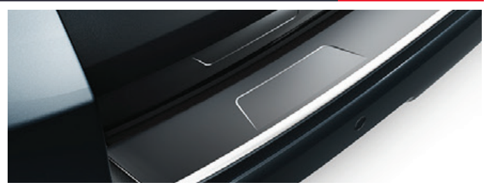
REAR BUMPER PROTECTION PLATE

Genuine tailored fit rubber floor mats help protect your carpets against the very worst conditions. They are impervious to dirt, mud and water and can removed for easy cleaning.