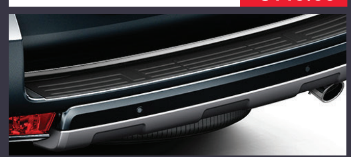
Complete your jeep's smooth flowing lines while creating an extra dimension of sporty looks and personality.