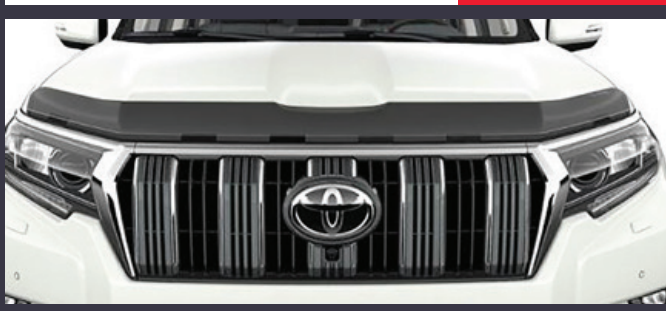
Ideal for bad weather and country road driving. The deflector diverts spray, mud and stones from the windshield.