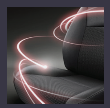
FABRIC PROTECTION €100.00