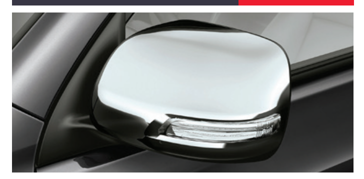
Toyota chrome mirrors create a highly contemporary appearance. The look is pure style.