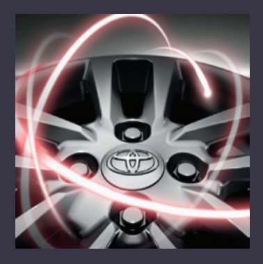
ALLOY PROTECTION €60.00